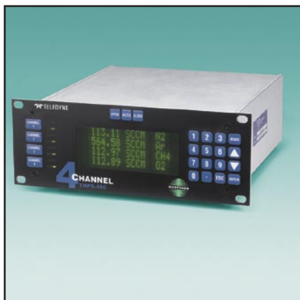
Power Supplies Available