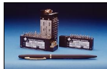
PSI Pressure Scanners

The T-Daq can be calibrated for a number of different thermocouple types. The type used can then be selected with links in the mating Omega connector.