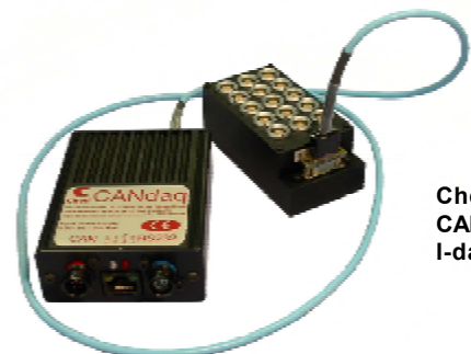
Chell CANdaq and I-daq